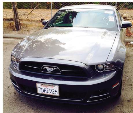
2014 V6 (The day we bought the car)