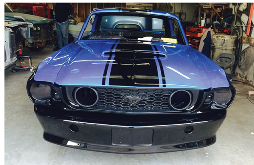
1967 Custom Build